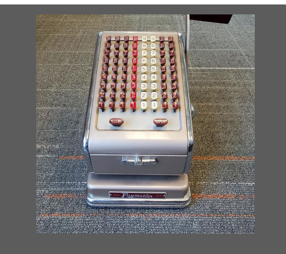
Paymaster adding machine, used in Sioux City, Iowa ~ 1960s.